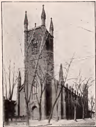
First Methodist Episcopal Church Albany, N. Y. Organized A. D. 1789